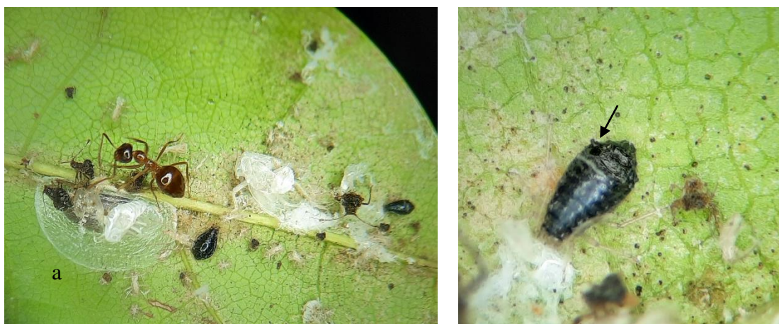
Figure 6 - P. lyropictus parasitized on the Norway maple leaves, on the site of former associated colonies of the aphid and the citrus flatid planthopper Metcalfa pruinosa . A cocoon of Neodryinus typhlocybae (a) and an ant can be observed

the ability to enter diapause in summer. All are common aphid parasitoids in urban green spaces, forest and agricultural environments (Dinh et al., 2017).