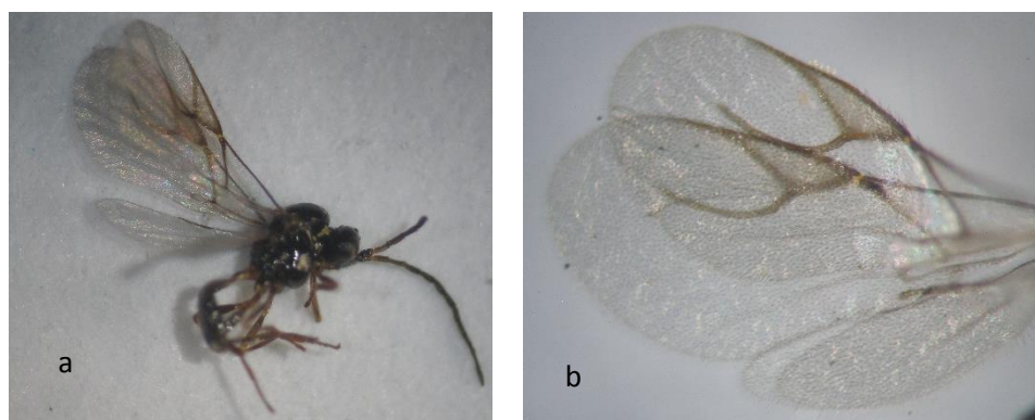
Figure 7 – Parasitoid wasp on P. lyropictus (a), forewings of parasitoid (b)

From the parasitized aphids reared in the laboratory have emerged five wasps as in the figure 7. After analysing and comparing the forewings venation of resulted specimens with images of the three species of parasitoids presented above, we appreciated them to be comparable to species of the genus Trioxys .