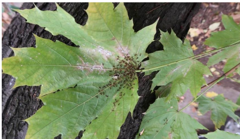
Figure 5 - Colonies of the P. lyropictus aphid visited by ants

Colonies of the P. lyropictus aphid are visited in abundance by ants that are attracted by the sweet excrement secreted by nymphs (Fig. 5). The mutualistic relationship between aphids and some ant species is well known (Bonnemain, 2010), ants are attracted and consume the honeydew secreted by aphids, thus protecting them against predators. The most frequent and abundant ant species reported to visit the aphids in the trees canopy are Lasius emarginatus , L. fuliginosus and L. niger but also Temnothorax spp. and Myrmica spp. (Stukalyuk et al., 2020).