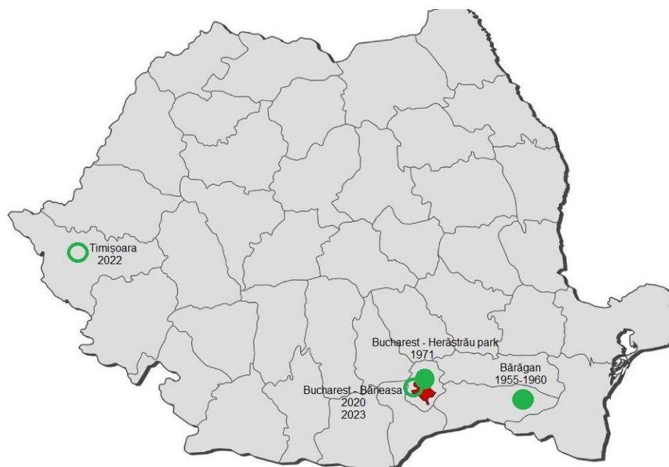
Figure 1- Locations of presence of Peryphyllus lyropictus is reported in Romania ● - previous reports, ○ - new reports

For Romania, only a number of four reports on the presence of the aphid P. lyropictus have been published so far, to which is added the one from the present paper, the fifth. First report dates from 1963 and belongs to Igor Ceianu who collected the aphid from leaves of Acer platanoides in the forestry fields of Experimental Forestry Station Bărağan situated in Ialomița County in south-east of the country (Boguleanu, 1994). Ceianu collected the insects for his doctoral dissertation (Pests of forest crops in Bărağan), of 270 pages, between 1955 and 1960 (Doniță et. al. 2011; N. Olenici, pers. commun.) and the abstract of doctoral dissertation was published in abstract in 1963. The following two reports were, the former also by Ceianu in 1970 for the same zone above mentioned, recording P. lyropictus on two maple species, Acer campestre and A. negundo , and the latter by Holman and Pintera (1981) collecting this species on A. platanoides in Herastrau Park in northern Bucharest in 1971. After this period, no other report on the aphid was disseminated until 2022, when Virteiu & Grozea (2023) reported about the occurrence of the aphid on A. platanoides in six green urban sites in the area of Timișoara city (Timiș County, Western Romania) in the period October-November 2022.