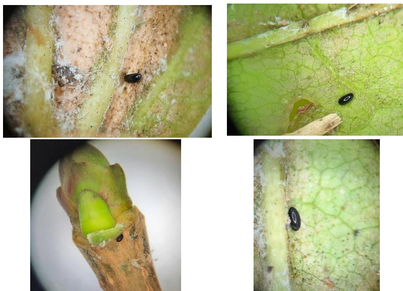
Figure 4 - Eggs laid on the shoot and the underside of the leaves

Colonies of the P. lyropictus aphid are visited in abundance by ants that are attracted by the sweet excrement secreted by nymphs (Fig. 5). The mutualistic relationship between aphids and some ant species is well known (Bonnemain, 2010), ants are attracted and consume the honeydew secreted by aphids, thus protecting them against predators. The most frequent and abundant ant species reported to visit the aphids in the trees canopy are Lasius emarginatus , L. fuliginosus and L. niger but also Temnothorax spp. and Myrmica spp. (Stukalyuk et al., 2020).