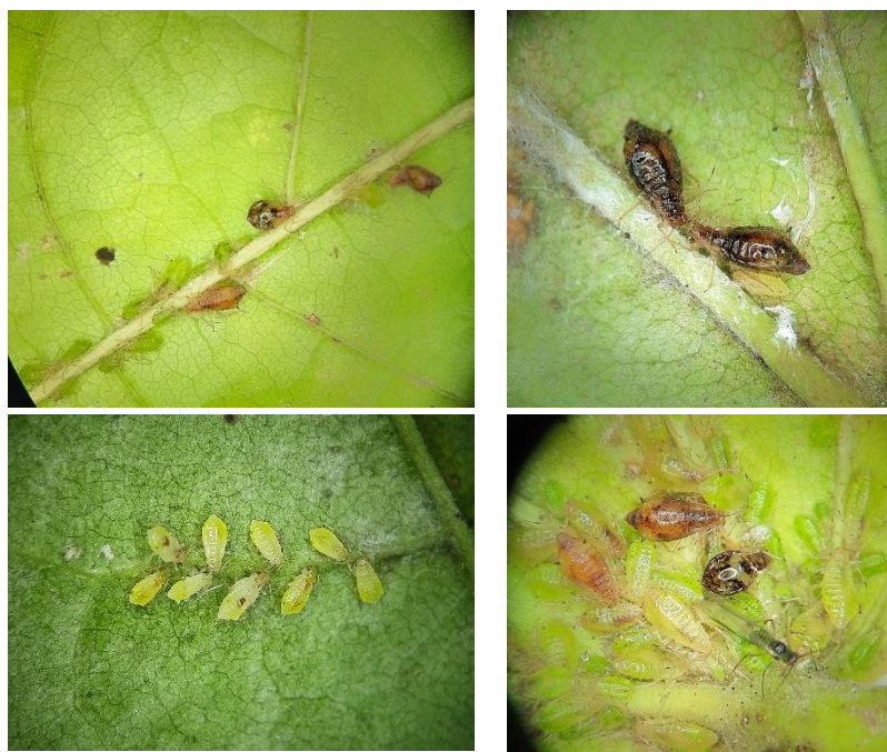
Figure 2 - Periphyllus lyropictus on the Norway maple Acer platanoides

The aphid develops throughout the seasons from spring to autumn, the most abundant population being in June. Unlike other species of the genus Peryphyllus (e.g. P. acericola , P. testudinaceus ), P. lyropictus has a life cycle without an obligate summer diapause of the larvae and the specialized aestivating dimorphs were not observed in this species (Junkiart et al., 2011; Stukalyuk et al., 2020).